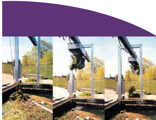
The Brackett Bosker® Overhead Trashrake operating fully automatically under heavy debris conditions

Ovivo designed, manufactured and installed the above Brackett Bosker® Overhead Trashrake with two machines on a common track each with a 3,000kg lifting capacity