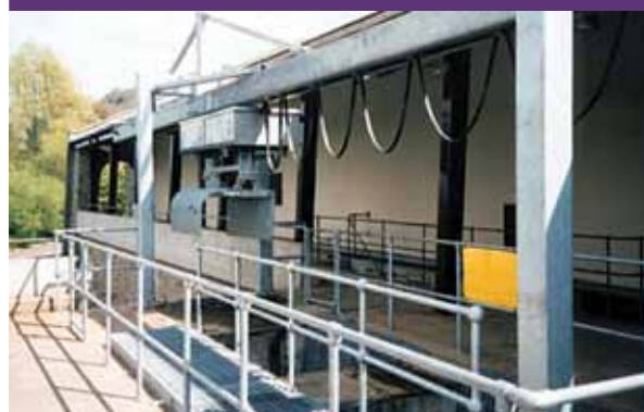
The gantry and grab can be designed to suit any layout