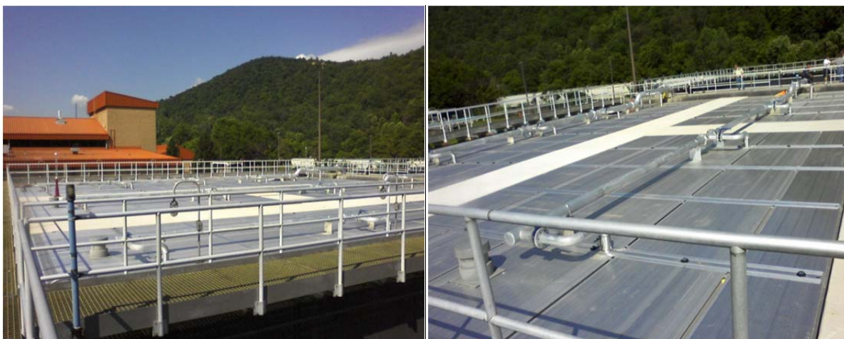
Figure 1. Bellefonte WWTP M-T.A.D. ® Facility

The Bellefonte WWTP M-T.A.D. ® Process design converted the existing equalization tank into three aerobic digestion tanks to be operated in series. Each aerobic digester tank was designed with an Airbeam ® Cover integrating Ovivo's MS ® diffusers and shear tubes to provide maximum mixing and aeration efficiency of thickened solids, minimize odors, and provide optimum temperature control during winter operations when Class B biosolids is most difficult to achieve.